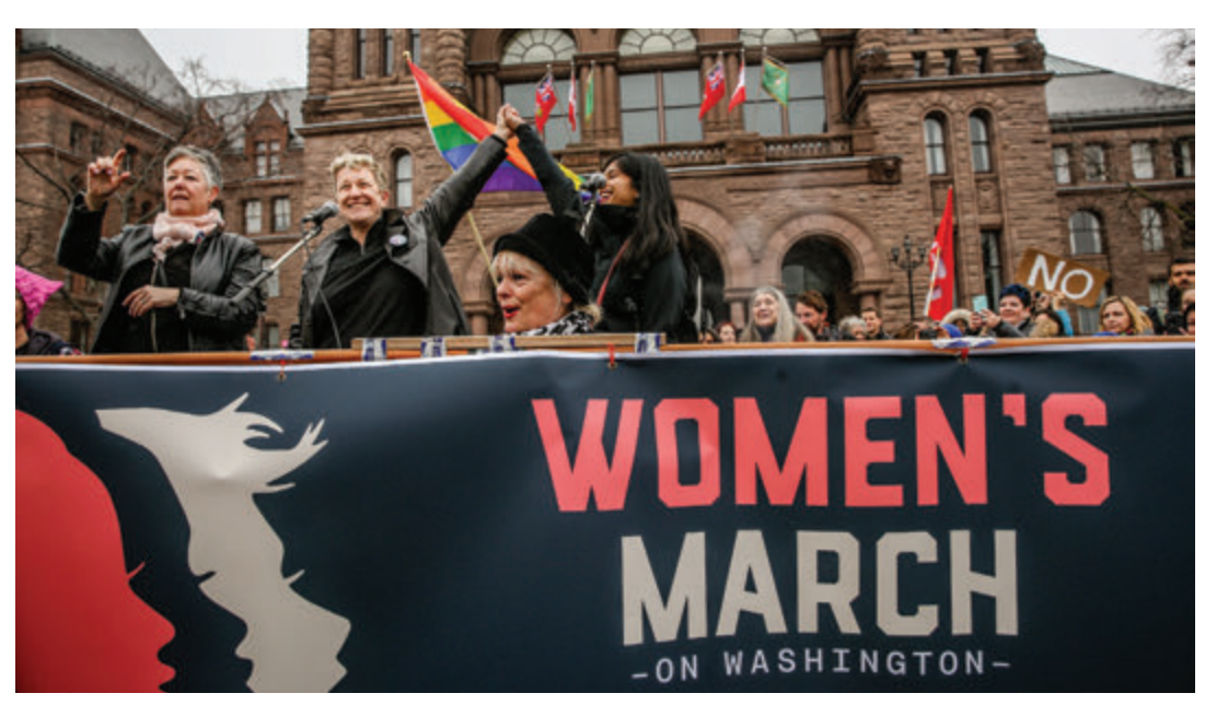
TORONTO, CANADA - January 21st, 2017: Toronto Women's March. A protest march in Toronto in solidarity with the women's march in Washington DC.

This year, in Toronto, Women March On— Defining Our Future, will proceed on January 20 at Nathan Phillips Square, 100 Queen Street West at 12 p.m. Details coming soon at www.facebook.com/events/312043389274448.