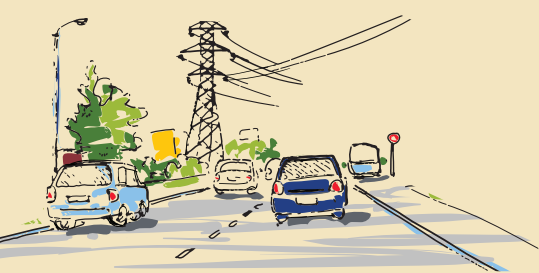
These ideas are based on the submission made to the Ministry of Environment and Climate Change.