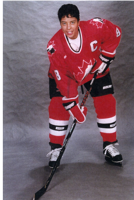
Angela James