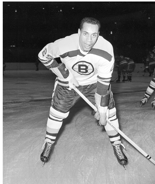
Willie O'Ree www.thecanadianencyclopedia.ca